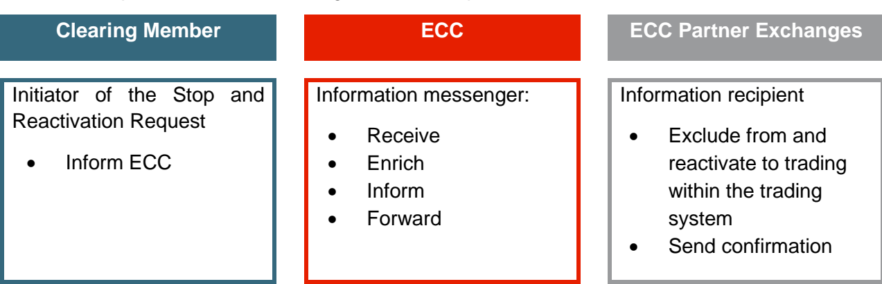
Figure 7: Roles and Responsibilities for Activating the Emergency Member Stop

The involved parties own the following roles and responsibilities: