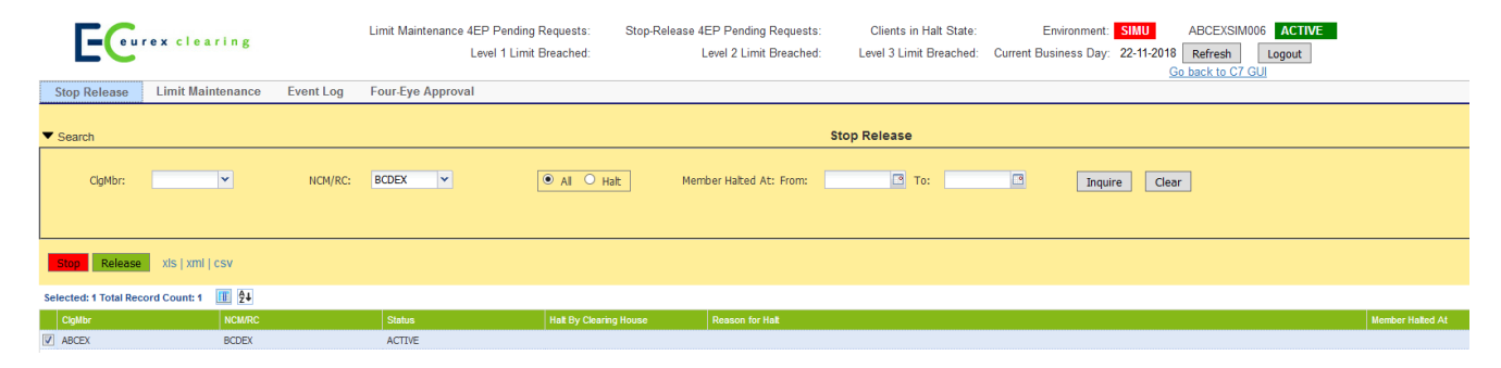
Figure 8 - Emergency Member Stop in Eurex Clearing system

On each business day during business hours Clearing Members have the possibility to stop a Trading Participant from trading by using the stop functionality in the Eurex Clearing system (see Figure 8). This will automatically trigger the rejection of all orders and quotes and will block any transaction or position adjustments on EEX market operated in the trading system T7<sup>10</sup>. In addition, ECC will no longer accept derivatives market transactions from any broker transaction processed via the Straight-Through Processing (STP) solution. For NOREXECO, the first transaction rejected by ECC due to an Emergency Member Stop will be accepted, but further trades will be revoked on exchange.