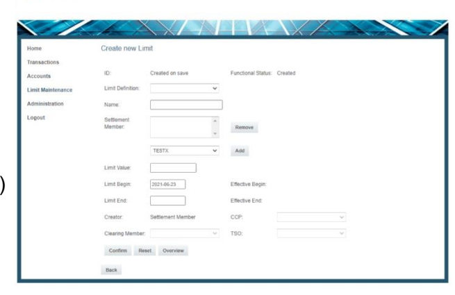
Figure 9: Emergency Member Stop in ECC Limit Self-Service Solution

To setup the respective limits two users need to be authorized for each Clearing Member at ECC. The first user creates the limit in the ECC Self-Service Limit Maintenance, the second user needs to confirm it. ECC will forward the Stop Request(s) to the respective Partner Exchange(s) which will perform the suspension of the Non-Clearing Member.