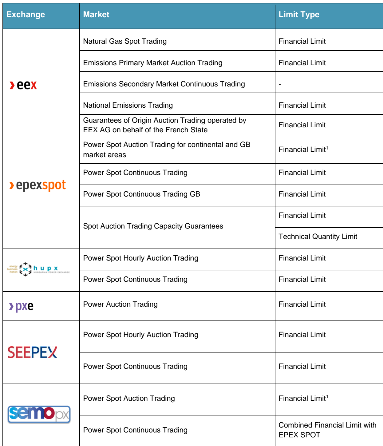
Figure 2 - Trading Limits for Spot Markets at the time of writing