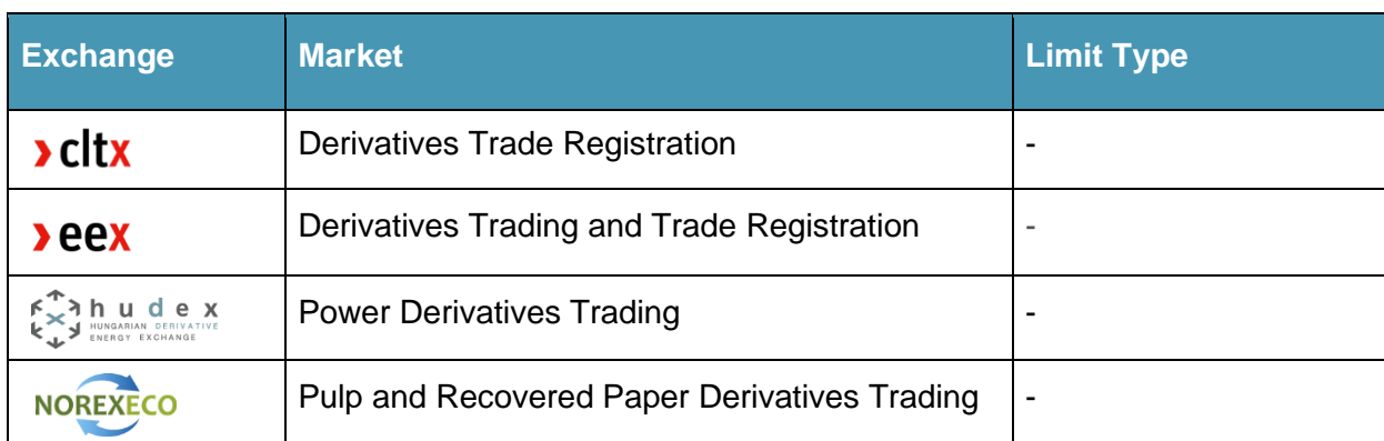
Figure 4 - Trading Limits for Derivatives Markets at the time of writing

ECC does not provide specific limit implementations for Derivative Clearing. Some exchanges offer the possibility to setup Pre-Trade Limits within the Trading Systems which are described in the rules and regulations by the Partner Exchanges, see Annex A.